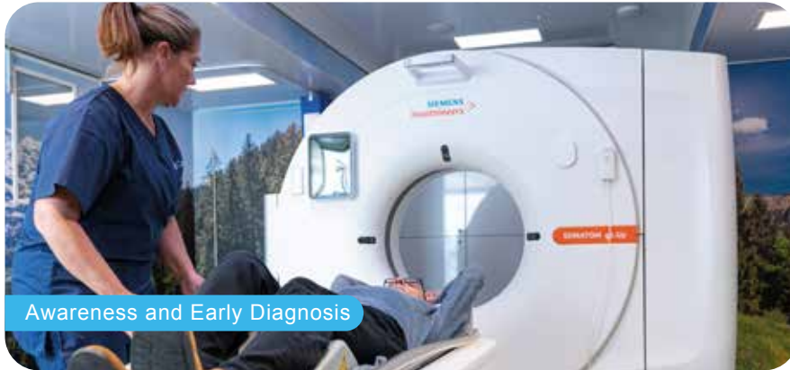
Awareness and Early Diagnosis

The NHS Targeted Lung Health Check screening programme in Humber and North Yorkshire has received additional funding of £1,135,429 from NHS England to purchase a second mobile CT scanning unit.