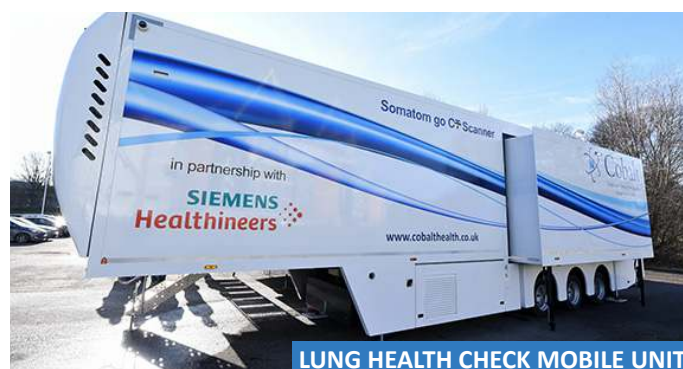
LUNG HEALTH CHECK MOBILE UNIT

Initially, eligible participants are contacted to take part in a telephone assessment with a specially trained nurse; those reaching the risk score threshold are then invited to attend a low dose CT scan on board a mobile unit at Castle Hill Hospital.