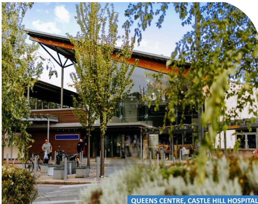
QUEENS CENTRE, CASTLE HILL HOSPITAL

“We have also made regular support calls to update patients on current waiting times and advise on any changes to symptoms.”